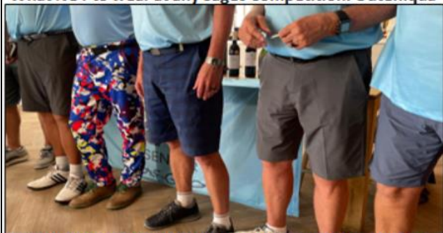
members were fined for incorrect competition clothing