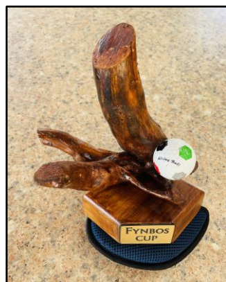
The new FYNBOS CUP