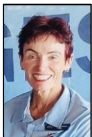
Voorsitters verslag vir April 2026