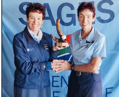
First winners of the Fynbos Cup : Kouga Sages