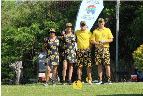
MIST OF GOLD – Sunflower Team